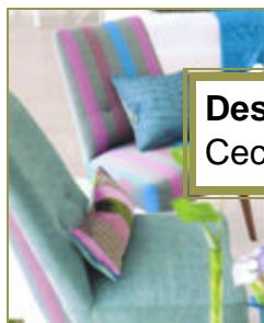
Designers Guild: Cecilia Trevira weaves