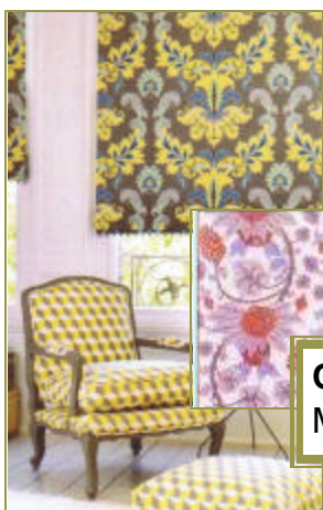
Osborne & Little: Maharani prints