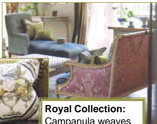
Royal Collection: Campanula weaves and prints