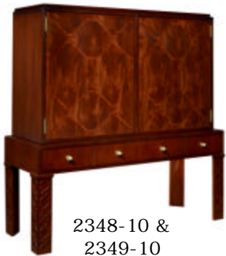
2348-10 & 2349-10