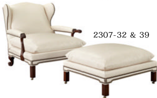
2307-32 & 39